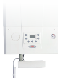
Condensate Pump Part Number: 3.026374