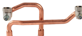
Pipe Crossover Kit Part Number: 3.032945